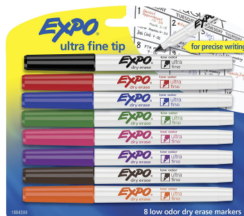
Ultra Fine Tip Expo