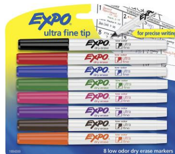
Ultra Fine Tip Expo